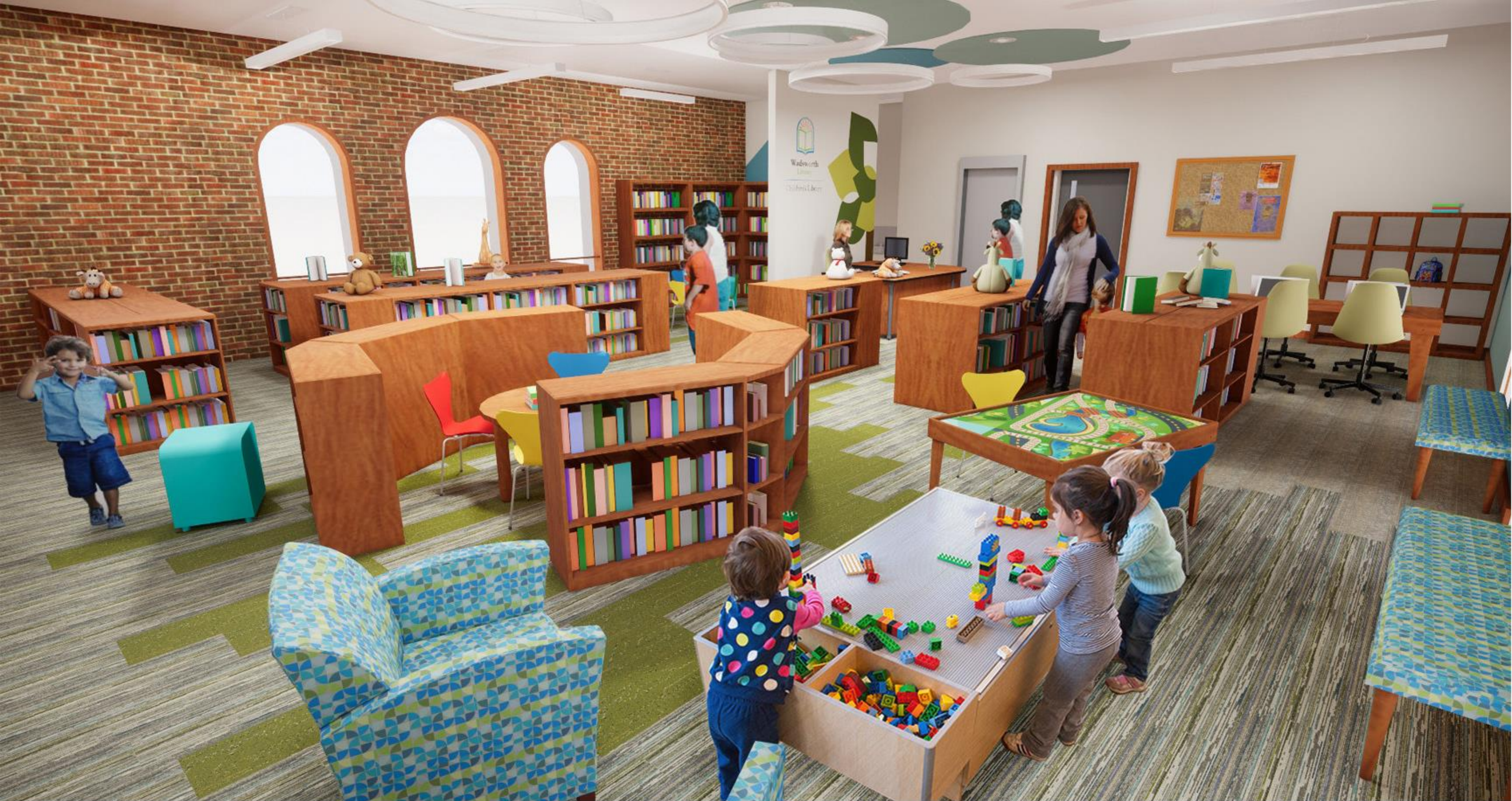
Rendered View of the Second Floor