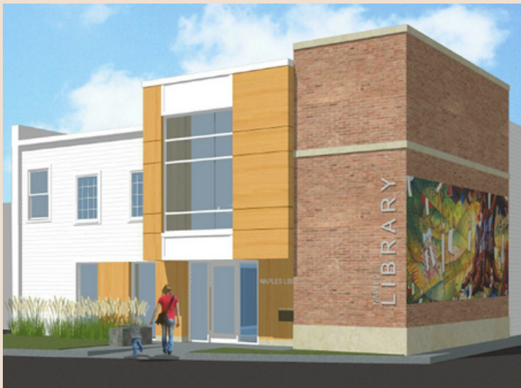
An artist's rendition of what the Naples Library will look like when renovations are completed.