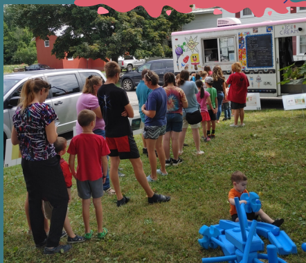
Patrons line up for free ice cream at Gorham's end of summer reading celebration.