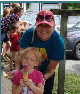
A child enjoys a sweet treat at Gorham's end of summer reading celebration.