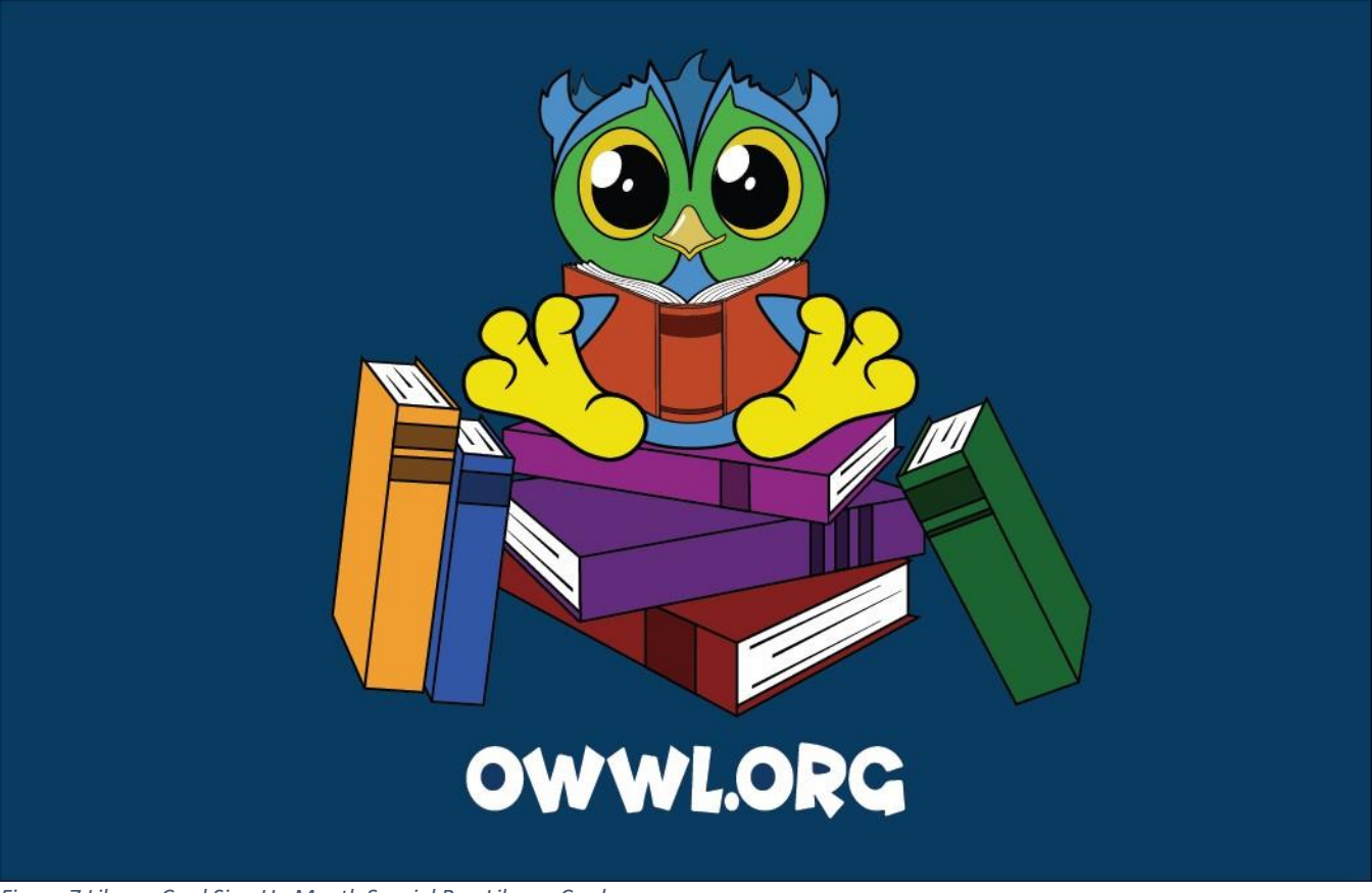
Figure 7 Library Card Sign Up Month Special Run Library Card