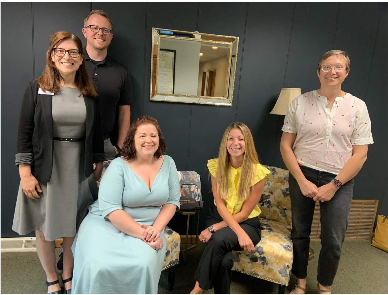
Figure 5 NYLA Open House 2022