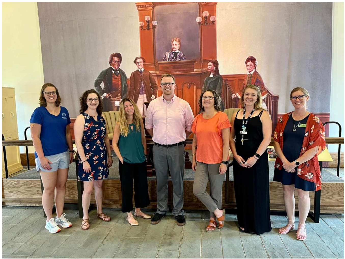
Figure 3 Field Trip to National Women's Hall of Fame