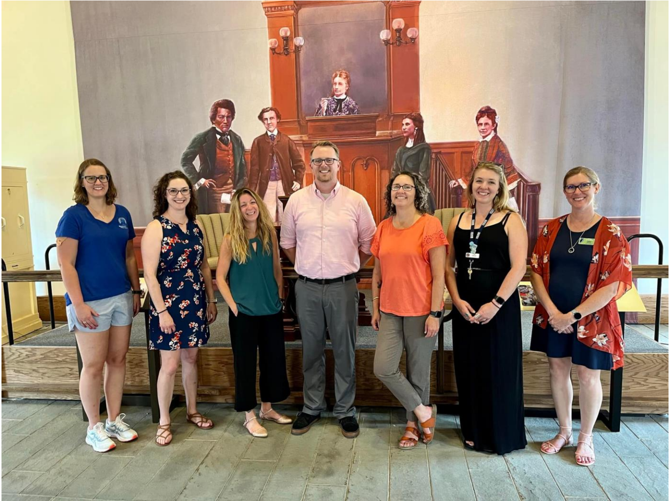
Figure 3 Field Trip to National Women's Hall of Fame