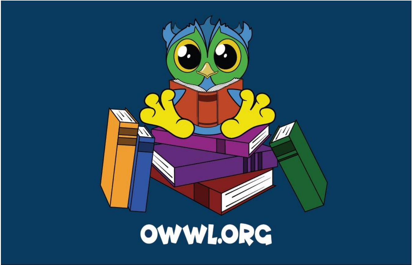
Figure 7 Library Card Sign Up Month Special Run Library Card