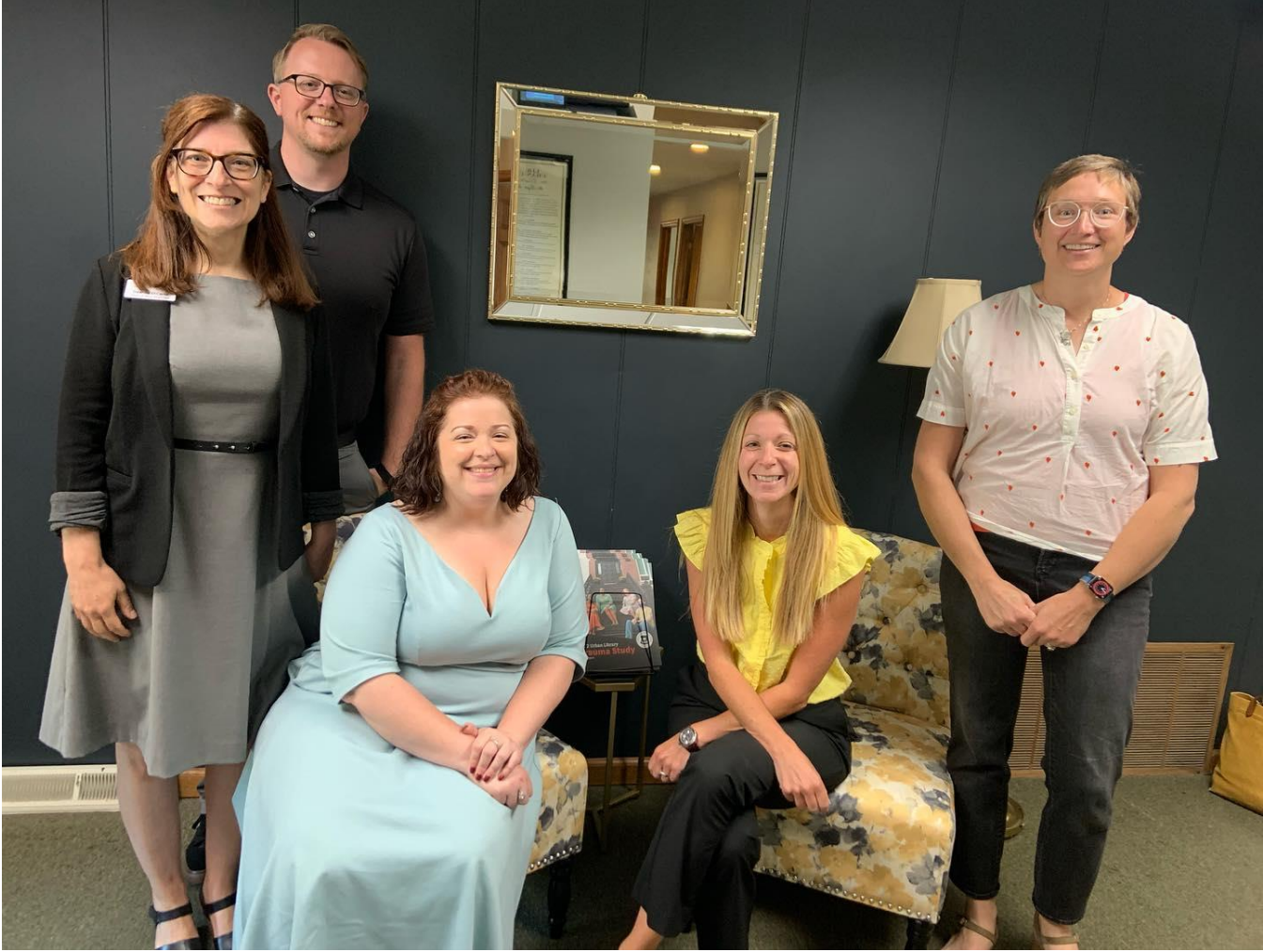
Figure 5 NYLA Open House 2022