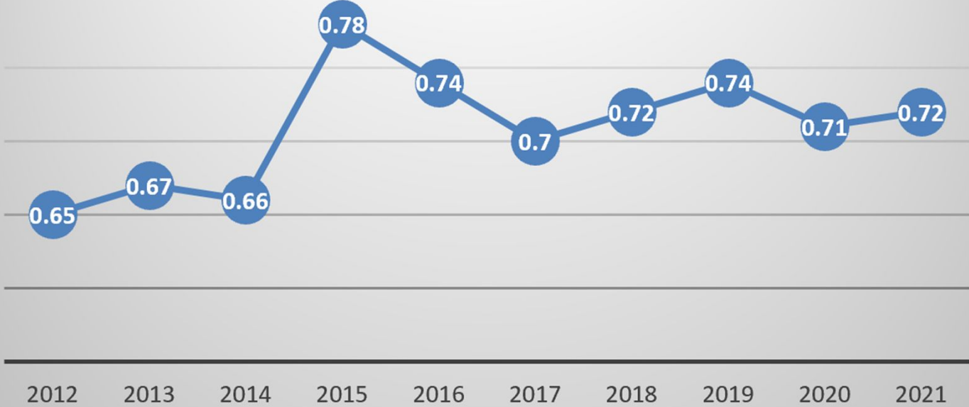
Annual Voter Approval on STLS Referendums